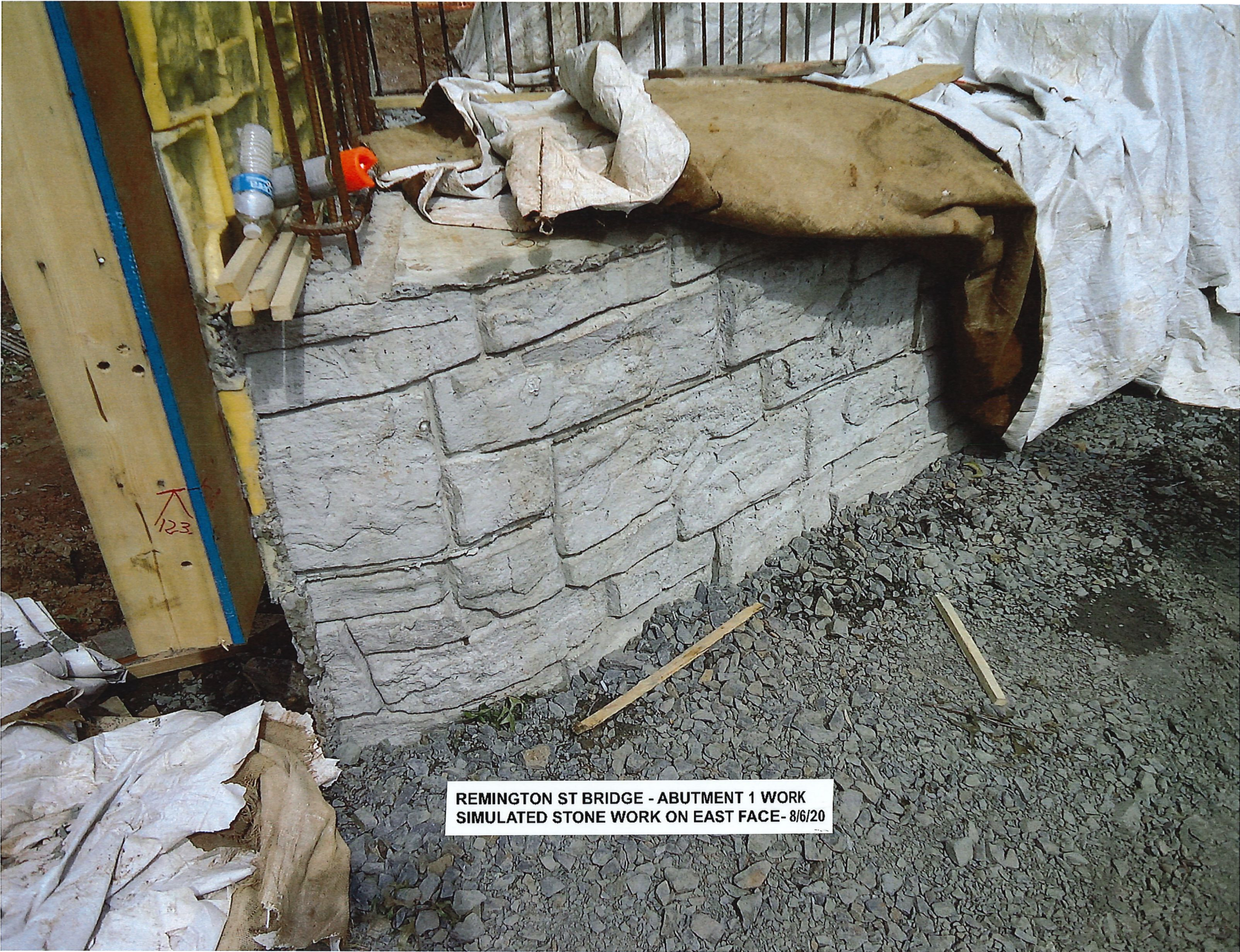
REMINGTON ST BRIDGE - ABUTMENT 1 WORK SIMULATED STONE WORK ON EAST FACE- 8/6/20