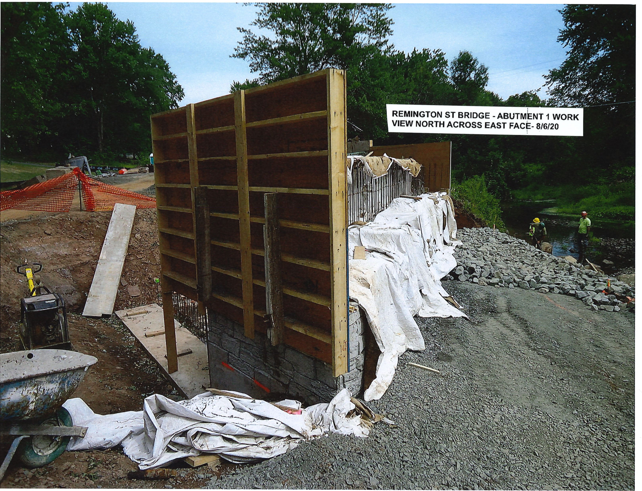
REMINGTON ST BRIDGE - ABUTMENT 1 WORK VIEW NORTH ACROSS EAST FACE- 8/6/20